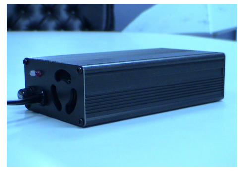
3A ~ 10A Charger